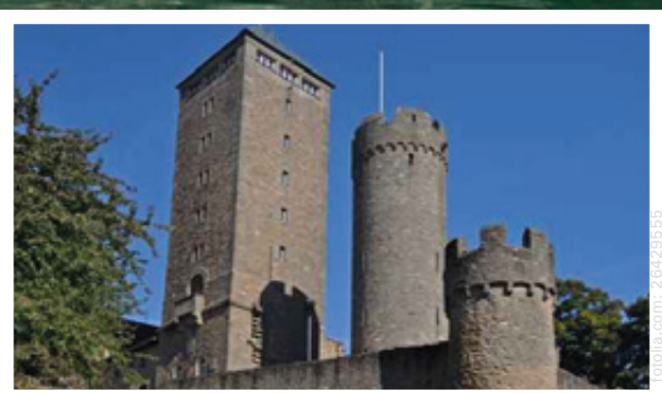
Starkenburg castle in Heppenheim gave the former Southhessian province its name.