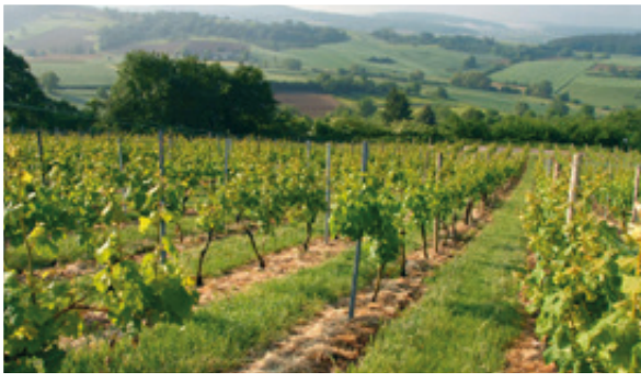
Even many wine connoisseurs can still learn something about the cultivating of vines on the educational wine trail in Groß-Umstadt.