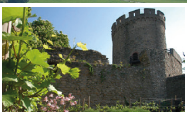
Alsbach palace also known as Bickenbach castle provides an excellent view of the Bergstraße.