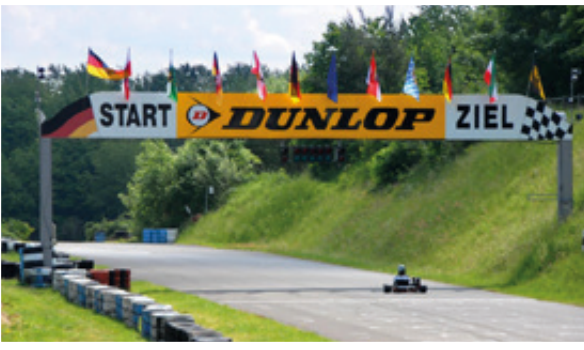
Ride a couple of laps in a go-cart – either in Schaafheim or in Groß-Zimmern.