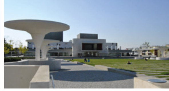
The completely renovated state theatre in Darmstadt is shining bright in new splendour and stages many interesting plays.