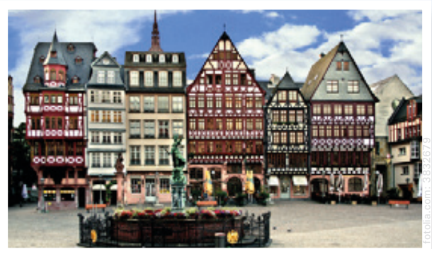
Just like the skyline, the 'Römer' (city hall) is one of Frankfurt's landmarks.