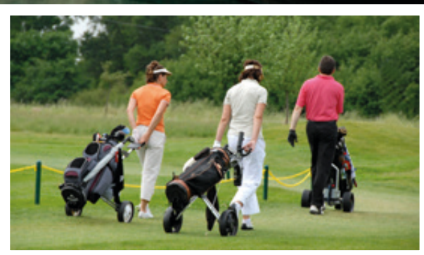
There are also a number of places in the region where one can play some golf.