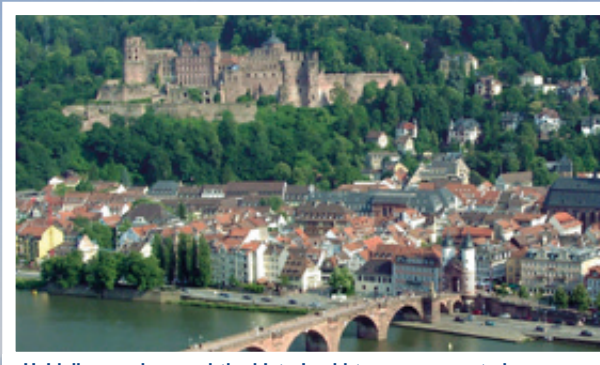
Heidelberg palace and the historic old town are counted among the most heautiful of their kind in Germany.