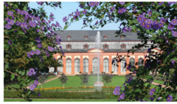
The small castle in the Orangery in Darmstadt is mostly used for concerts, conferences and private events.