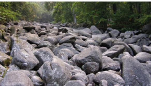
The Felsenmeer ('sea of cliffs') in Lautertal is one of the highlights in the Geo-Naturpark Bergstraße-Odenwald.