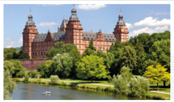
Johannisburg palace is situated right at the Main river in the city of Aschaffenburg in lower Franconia.