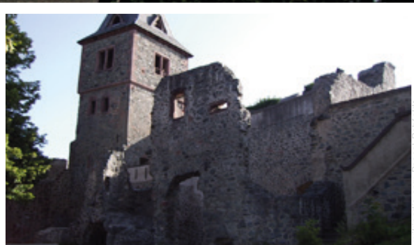
The ruins of the famous Frankenstein castle that has been housing the biggest Halloween party in Europe for years.