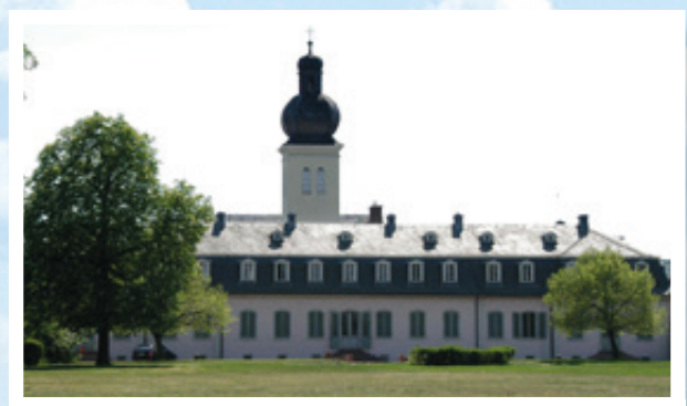
Braunshardt palace is also called the 'pearl of Rococo'. The colourful rooms are always worth a visit.