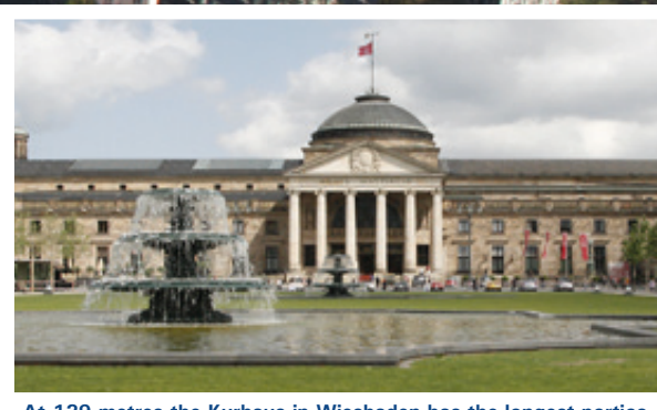
At 129 metres the Kurhaus in Wiesbaden has the longest portico in Europe and it is also the social centre of the city.

In the region around Frankfurt, Mainz, Wiesbaden, Offenbach, Darmstadt and Heidelberg those seeking relaxation as well as those who want to stay active can get their money's worth.