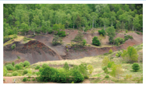
At first glance Messel Pit looks inconspicuous – but it is a world-wide unique treasure of fossils.