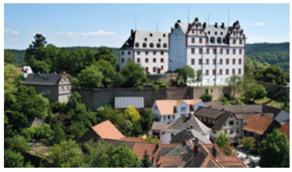
Lichtenberg palace in Fischbachtal was first built as a castle in the 12th century and later converted.